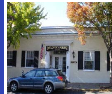
Doylestown, Bucks County Borough Hall

Membership in the SRA Community Liaison Program does not involve a significant time commitment. All we require is a willingness to get involved in the communities that you already care about. Together, we can be a powerful voice for our industry and private property rights.