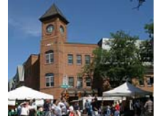
Kennett Square, Chester County

Whether you are currently active within your municipality and interact with local officials or would like to, the SRA will give you the tools, opportunities and information to make a difference.